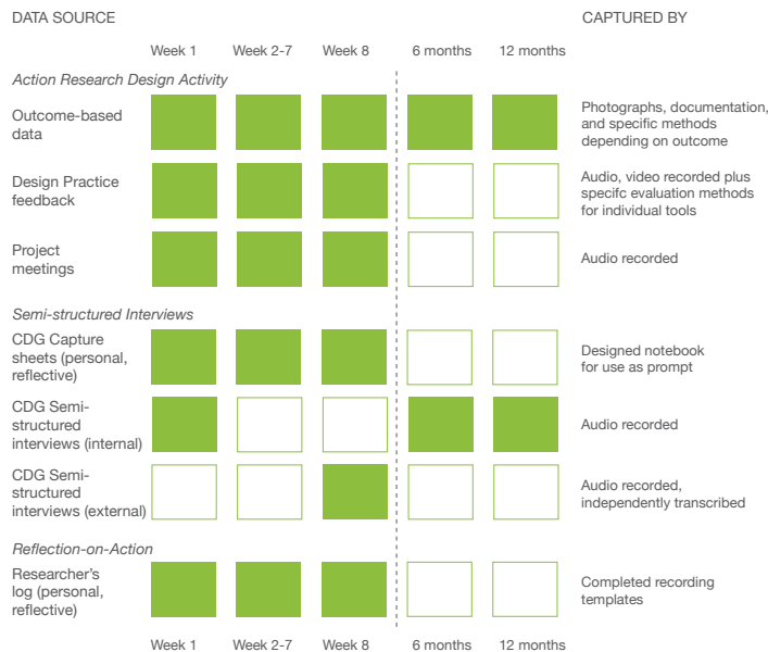
Figure 1: Data Collection Plan (*CDG = Co-Design Group)

The qualitative methods collected data from project stakeholders, who held the knowledge of the projects’ inherent values. These methods were used consistently across the case-study to capture the design object, the Designer’s activity and the project stakeholders’ responses and opinions in each setting. The data collection methods were broadly split into three sections: action research design activity, semi-structured interviews, and reflection-on-action. The plan for data collection in each project can be seen in Figure 1.